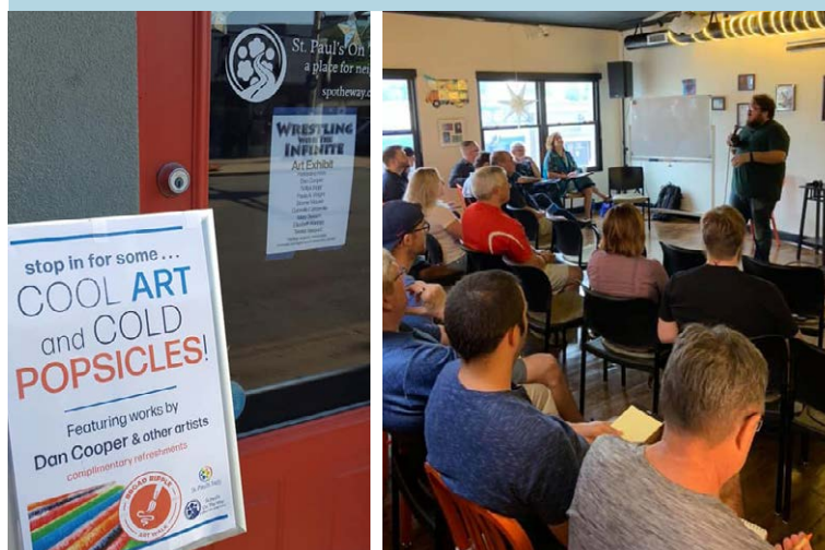
BROAD RIPPLE ART WALK