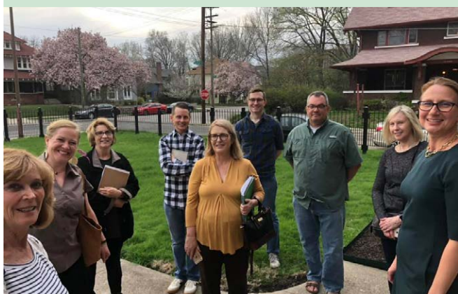
OUTREACH OVERSIGHT COMMITTEE MEMBERS TOURED TRINITY HAVEN RESIDENTIAL FACILITY FOR LGBTQ YOUTH