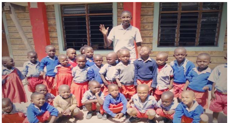
SUPPORT OF THE MISSION IN MOMBASA MINISTRY HELPS PROVIDE schooling, transportation, nutrition, and care for children and youth in Kenya.