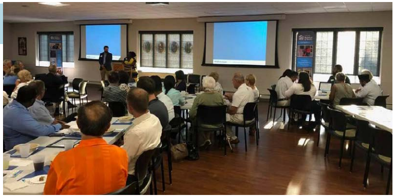
INDY HABITAT FOR HUMANITY INTERFAITH DINNER, HOSTED BY ST. PAUL'S