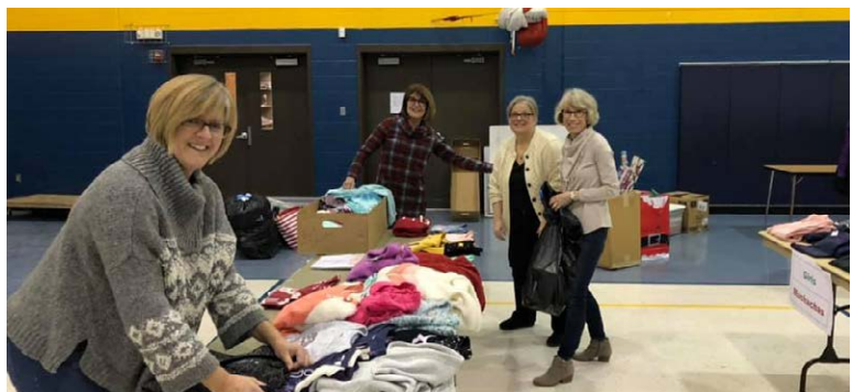
ANNUAL CHRISTMAS FAMILIES PROJECT, SPONSORSHIP FOR 75 CHILDREN from IPS #43 and included a Santa Shop set up in the school's gym for parents to select and wrap items.