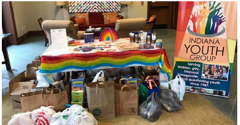
LENTEN COLLECTION FOR IYG, SPONSORED BY OUR LGBTQ FAITH GROUP