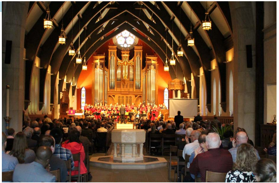
BACH'S ST. JOHN PASSION , SANG BY ST. PAUL'S CHOIR WITH ORCHESTRA