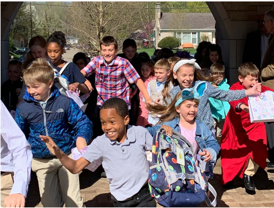
2019 EASTER EGG HUNT :: 1,000 PEOPLE WORSHIPPED AT ST. PAUL'S FOR EASTER EVE/DAY