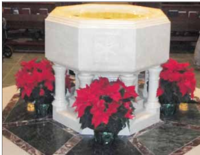
Can you help us decorate St. Paul's in anticipation of Christmas?