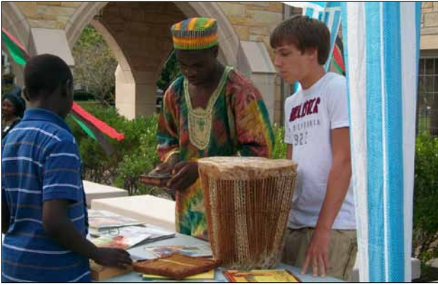
Don't miss the Kenyan Culture Fest at St. Paul's Saturday, September 25 from 4:00-7:00 p.m.