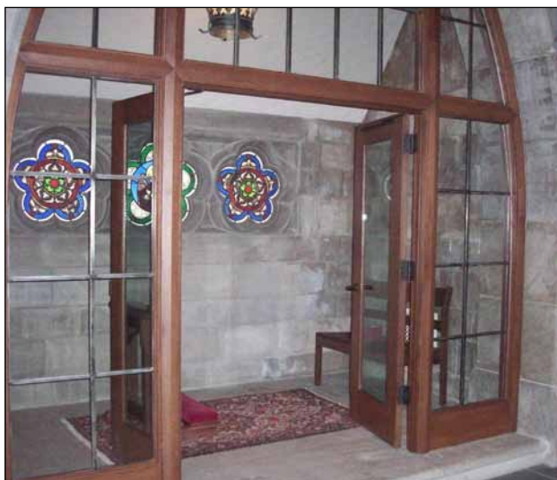
The Prayer Alcove, a small room to the left of the lectern, offers a private place to pray, meditate and be still.