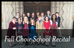
Fall Choir School Recital