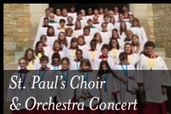
St. Paul's Choir & Orchestra Concert