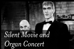
Silent Movie and Organ Concert